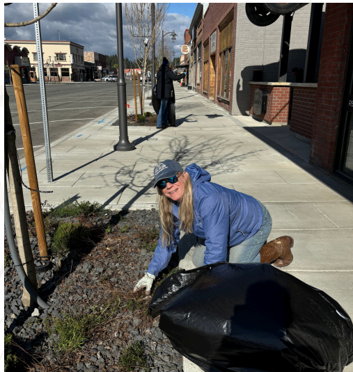
Spring Clean-up Downtown Cle Elum