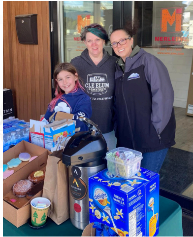
Cle Elum Downtown Association Downtown Clean-Up