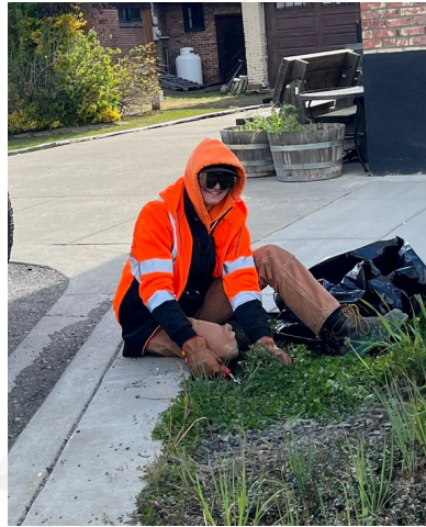
Public Works Downtown Weeding