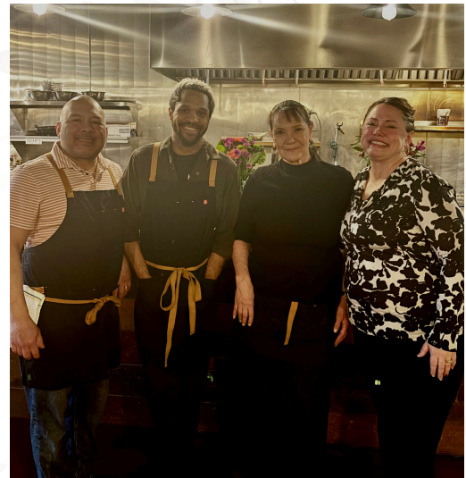
Spring Business Connection Orchard Restaurant