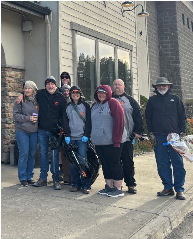
Merle Team Downtown Clean-up