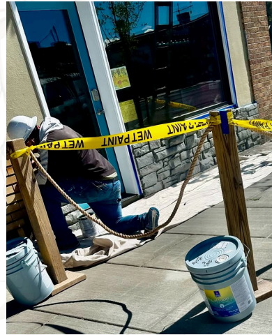
509 Bakehouse Beautification & Facade In-Progress