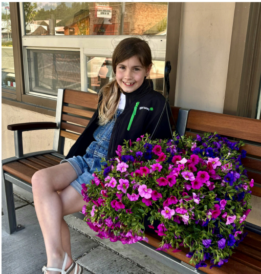
Cle Elum in Bloom Hanging Baskets