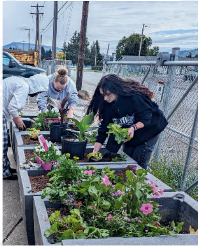
Cle Elum In Bloom Planting 2024