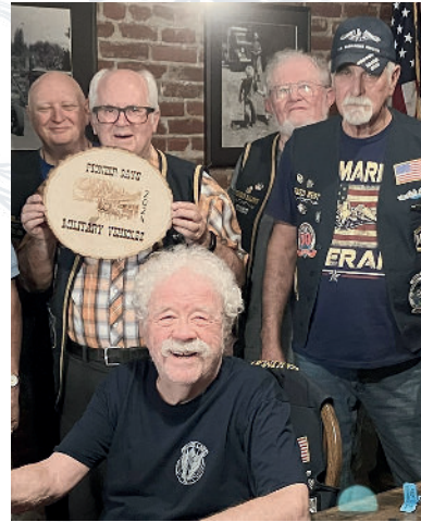
Pioneer Day Parade Winners 2024