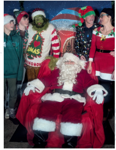
Grinch, Santa & Pioneer Coffee December 2024